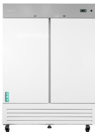
CMRTSS500 500L Solid Door RTS Cabinet